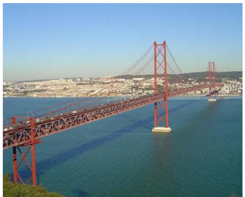
Bridge "25 de Abril" over the River Tagus